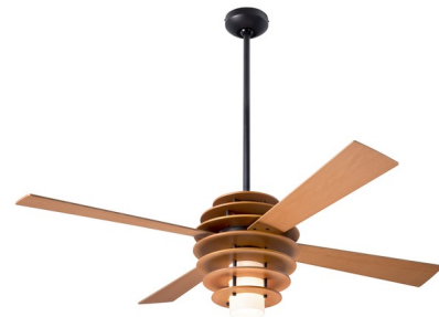
Shown in dark bronze body / maple details / maple blades

LAMP LIFE . . . . . 25000 hours COLOR RENDERING . . . . . 80 CRI LAMP COLOR . . . . . 3000K LUMENS/WATT . . . . . 91.43 LUMINOUS FLUX . . . . . 1600 lumens