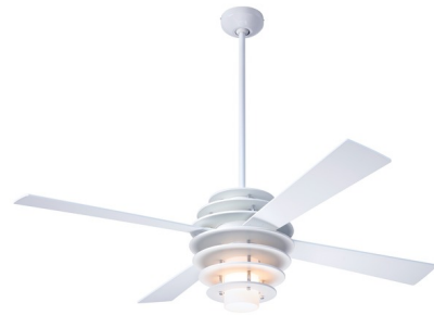
Shown in white body / white details / white blades

LAMP LIFE . . . . . 25000 hours COLOR RENDERING . . . . . 80 CRI LAMP COLOR . . . . . 3000K LUMENS/WATT . . . . . 91.43 LUMINOUS FLUX . . . . . 1600 lumens