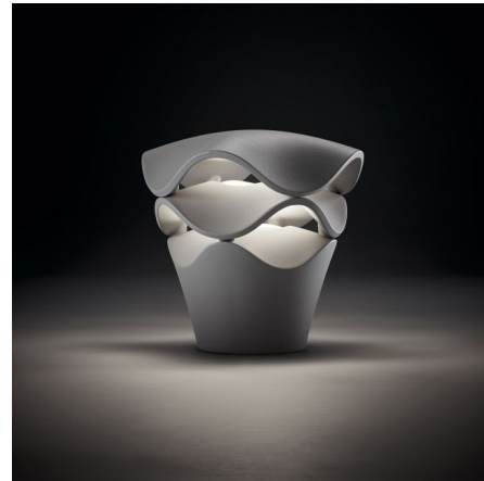
Shown in stone grey

The Cornet Outdoor Bollard is made of high-density polyurethane in Stone Grey with interior elements made of stainless steel. Available in three sizes. Integrated 8 watt 120 volt LED module. Dimmable with TRIAC dimming systems. 10.07 inch width x 10.4/20.5/30.31 inch height. Two anchoring options for bollards: 1. Anchoring to decking or ground- screws and anchor accessories not included. 2. Anchoring to concrete foundation- mounting accessories not included, contact customer service to order. ETL listed. IP55 wet rated.