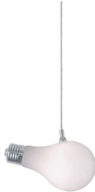
Shown in: Satin Nickel / White

FJ Zzz Lamp pendant features a white blown glass shaped like an incandescent A lamp. Finish available in satin nickel with a 10 foot long field-cuttable coaxial cable. Includes fast jack connector. System compatibility includes monorail, monorail 2 circuit, and any fast jack power canopy or track transformer, sold separately. General light distribution. ETL listed. One 20 watt 12 volt JC G4 bi-pin halogen lamp included. 5.65 inch width x 3.15 inch height.