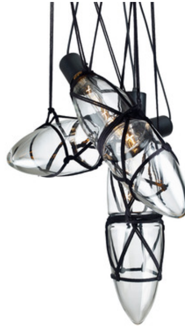
Shown in: Black / Clear

Shibari is not just a technique of tying objects with ropes, it is a way of communication within a hidden system of lines and loops. The Japanese call it Kinbaku: the beauty of tight binding. The Shibari 3 Pendant features three hand-blown crystal shades with a Black powder-coated finish. TRIAC dimming.