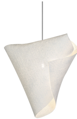
Shown in stainless steel / white

The Ballet Releve Pendant is made from the Arturo Alvarez exclusive material, SIMETECH. Its shape is formed by the superposition of its vertexes, allowing freedom of flexibility in the material. Its asymmetry makes its forms change depending on the point of view.