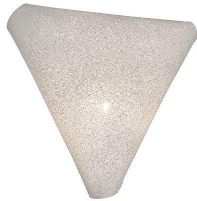
Shown in stainless steel / white

The Ballet Wall Sconce is made from painted stainless steel mesh. Its shape is formed by the superposition of its vertexes, allowing freedom of flexibility in the material. Its asymmetry makes its forms change depending on the point of view.