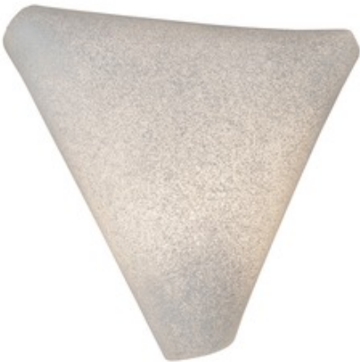
Shown in: Stainless Steel / White

The Ballet Wall Sconce is made from the Arturo Alvarez exclusive material, SIMETECH. Its shape is formed by the superposition of its vertexes, allowing freedom of flexibility in the material. Its asymmetry makes its forms change depending on the point of view. Available in White, Grey, Taupe, or Beige. Two lighting options available. UL listed.