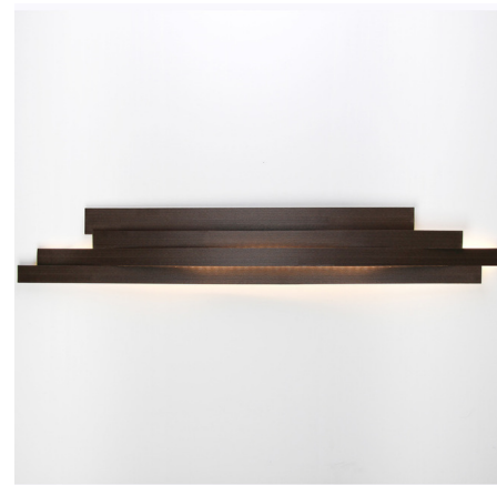
Shown in stainless steel / brown

The Li Wall Light is made with strips of pressed cellulose obtained by an organic recycling process. Cellulose, which has been used in Japan for packaging purposes since the 16th century due to its strength and resistance, allows subtle brightness to shine through the bands.