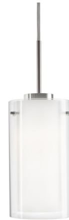
Shown in brushed nickel / clear/ opal

PRODUCT DIMENSIONS . . . . . Max Overall Height: 127.1" LAMP LIFE . . . . . 50000 hours COLOR RENDERING . . . . . 90 CRI LAMP COLOR . . . . . 3000K LUMENS/WATT . . . . . 55.05 LUMINOUS FLUX . . . . . 523 lumens