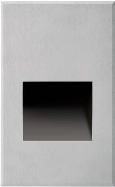
Shown in: Brushed Nickel

The Sonic Outdoor Vertical Step Light is a sleek vertical oriented, rectangular-shaped recessed light that is ideal for step or courtesy light use. The design of the die cast aluminum body with powder coat or cast stainless steel for marine-grade fully conceals the light source so there is no glare. Rated for outdoor use, but can be used inside as well. Fits into a single gang box. No driver required.