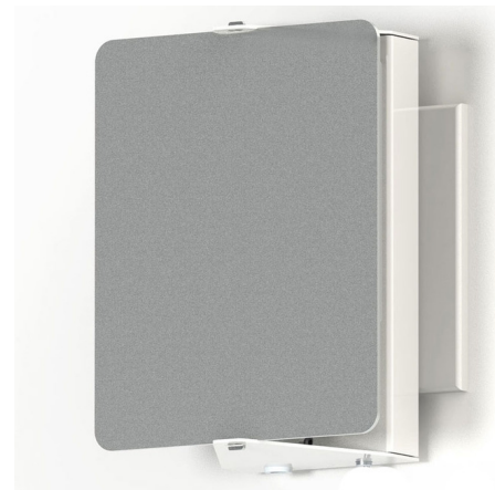
Shown in white / aluminum

COLOR RENDERING . . . . . 85 CRI LAMP COLOR . . . . . 3000K LUMENS/WATT . . . . . 23.50 LUMINOUS FLUX . . . . . 235 lumens