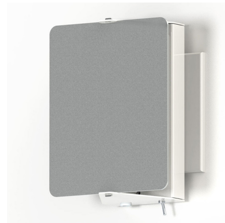
Shown in white / aluminum

The Applique a Volet Pivotant Plug-In Wall Light features an adjustable aluminum shade that can be tilted to adjust the beam and intensity of the light. The fixture's design is indicative of Charlotte Perriand's concept of useful forms, which often incorporated minimalist designs with simple shapes. May be mounted vertically or horizontally. Cord and plug are removeable for hardwired installation (includes square mounting plate to cover standard 4 inch junction box). Switch located on fixture's frame.