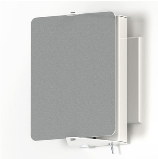
Shown in: White / Aluminum

The Applique a Volet Pivotent Plug-In Wall Light features an adjustable aluminum shade that can be tilted to adjust the beam and intensity of the light. The fixture's design is indicative of Charlotte Perriand's concept of useful forms, which often incorporated minimalist designs with simple shapes. May be mounted vertically or horizontally. Cord and plug are removeable for hardwired installation (includes square mounting plate to cover standard 4 inch junction box). Switch located on fixture's frame.