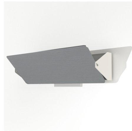
Shown in white / aluminum