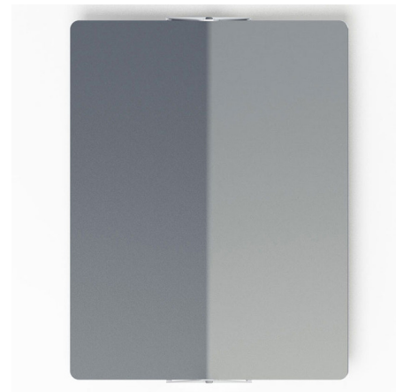
Shown in white / aluminum

The Applique a Volet Pivotant Plie Wall Light features an adjustable aluminum shade that can be tilted to adjust the beam and intensity of the light. The fixture's design is indicative of Charlotte Perriand's concept of useful forms, which often incorporated minimalist designs with simple shapes. May be mounted vertically or horizontally. Includes square cover plate for US junction box.