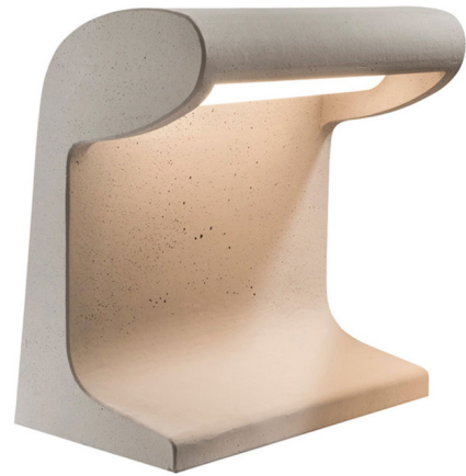
Shown in concrete / white

Originally designed by Le Corbusier in 1952, the Borne Beton Table Lamp pairs rigid concrete with an elegantly curved silhouette to create an intriguing contrast. The integrated LED light source is housed behind a white PMMA diffuser tucked within the top of the lamp to gently disperse light downwards. Dimmer switch located on cord.