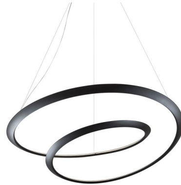
Shown in matte black

PRODUCT DIMENSIONS . . . . . Cable Length: 98" COLOR RENDERING . . . . . 83 CRI LAMP COLOR . . . . . 2700K LUMENS/WATT . . . . . 5714 LUMINOUS FLUX . . . . . 4000 lumens