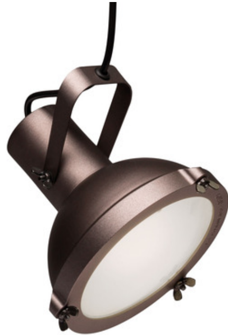
Shown in: Black / Moka

The Projecteur 165 Pendant is a mini, adjustable version of Le Corbusier's iconic Projecteur design from 1954. The aluminum body is paired with a rounded, sandblasted glass diffuser that is fastened to the body with locking clips. An adjustable hinge allows the light to be angled to provide task and accent lighting as well as downward lighting. Includes black cord and canopy.