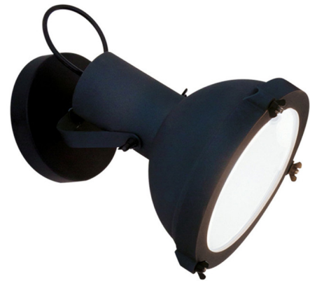
Shown in matte black / night blue

The Projecteur Wall Light was inspired by the fixtures Le Corbusier designed for India's Chandigarh High Court in 1954. The aluminum body is paired with a rounded, sandblasted glass diffuser that is fastened to the body with locking clips. The body is mounted on an adjustable frame that can be tilted and rotated to aim the light beam. Maybe installed as a wall or ceiling light. The 8.7 inch diameter fixture includes a Matte Black finished frame and canopy. The frame and canopy of the 14.6 inch diameter fixture are in the same finish as the lamp's body.