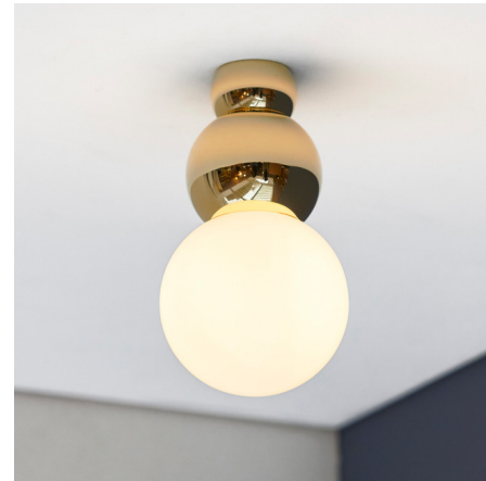
Shown in polished brass / opal

The Ball Ceiling Light, designed around the classic incandescent bulb, is an exercise to abstract the bulb into a perfectly spherical ball, celebrating its perfect shape by repeating it in metal. Includes a paintable junction box cover which will cover standard 4 inch junction boxes. The j-box cover extends beyond the fixture and will be visible.