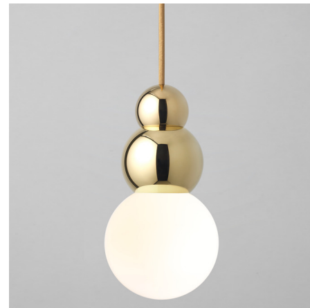
Shown in polished brass / opal

The Ball Flex Pendant, designed around the classic incandescent bulb, is an exercise to abstract the bulb into a perfectly spherical ball, celebrating its perfect shape by repeating it in metal. Includes a paintable junction box cover which will cover standard 4 inch junction boxes. The j-box cover extends beyond the fixture and will be visible.