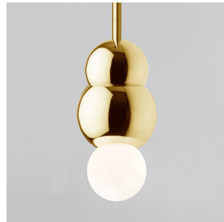
Shown in brass / opal

PRODUCT DIMENSIONS . . . . . Adjustable Overall Height: 8" to 82" LAMP COLOR . . . . . 2700K LUMENS/WATT . . . . . 125.00 LUMINOUS FLUX . . . . . 250 lumens