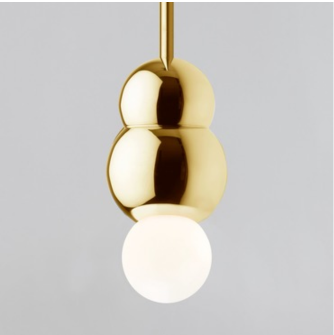
Shown in: Brass / Opal

The Ball Rod Pendant, designed around the classic incandescent bulb, is an exercise to abstract the bulb into a perfectly spherical ball, celebrating its perfect shape by repeating it in metal. The brass finish is unlacquered and will naturally oxidize and darken over time. Includes a paintable junction box cover which will cover standard 4 inch junction boxes. The j-box cover extends beyond the fixture and will be visible. Upon ordering, please supply required drop length of fixture, measured from the ceiling to bottom fitting. Available from 8 to 82 inches. Please contact Customer Service to order.