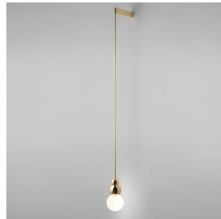
Shown in polished brass / opal

The Ball Flex Bracket Wall Light, designed around the classic incandescent bulb, is an exercise to abstract the bulb into a perfectly spherical ball, celebrating its perfect shape by repeating it in metal. The brass finish is unlacquered and will naturally oxidize and darken over time. Includes a paintable junction box cover which will cover standard 4 inch junction boxes. The j-box cover extends beyond the fixture and will be visible.