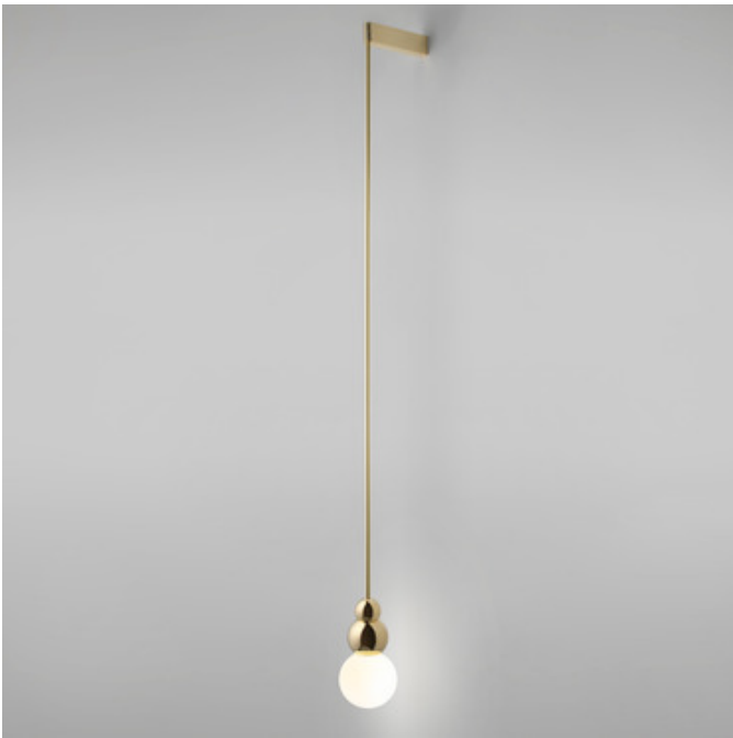
Shown in: Polished Brass / Opal

The Ball Flex Bracket Wall Light, designed around the classic incandescent bulb, is an exercise to abstract the bulb into a perfectly spherical ball, celebrating its perfect shape by repeating it in metal. The brass finish is unlacquered and will naturally oxidize and darken over time. Includes a paintable junction box cover which will cover standard 4 inch junction boxes. The j-box cover extends beyond the fixture and will be visible.