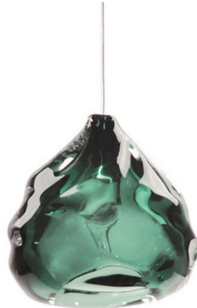
Shown in: Satin Nickel / Steel Grey

The Happy lights take advantage of the thickness and brilliance of our crystal to create a light with unending refractions. Each one is hand manipulated to create a creased and singularly individual form. The works are blown in solid clear crystal or use the Italian technique of sommerso or encased color. Hand blown and shaped in lead free crystal. No molds are used, and each glass shape is unique. Made in California and signed by Caleb and Carmen. Each piece is handmade; dimensions and color may vary slightly. Note: Canopy is required, and sold separately below. FJ connector and 6 feet of cable are included.