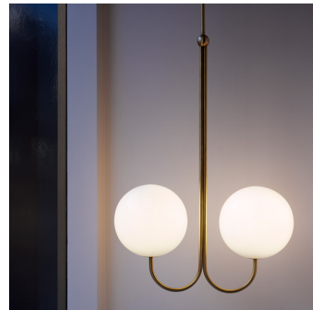
Shown in satin brass / opal

LAMP COLOR . . . . . 2700K LUMENS/WATT . . . . . 94.29 LUMINOUS FLUX . . . . . 330 lumens