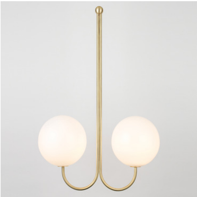
Shown in: Satin Brass / Opal

Inspired by the shape of fishing hooks, Double Angle consists of two luminous spheres and a double hook. The overall height is fixed and cannot be adjusted. Includes a paintable junction box cover which will cover standard 4 inch junction boxes. The j-box cover extends beyond the fixture and will be visible.