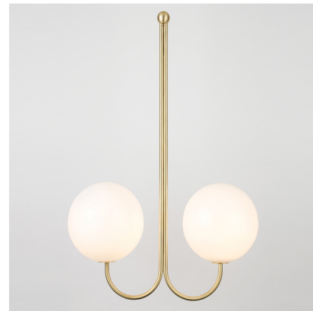
Shown in satin brass / opal

Inspired by the shape of fishing hooks, Double Angle consists of two luminous spheres and a double hook. The overall height is fixed and cannot be adjusted. Includes a paintable junction box cover which will cover standard 4 inch junction boxes. The j-box cover extends beyond the fixture and will be visible.