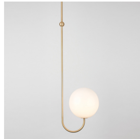
Shown in satin brass / opal

Inspired by the shape of fishing hooks, Single Angle consists of a luminous sphere and a single hook. The overall height is fixed and cannot be adjusted. Includes a paintable junction box cover which will cover standard 4 inch junction boxes. The j-box cover extends beyond the fixture and will be visible. Upon ordering, please supply required drop length of fixture, measured from the ceiling to bottom fitting. Available from 29 to 85 inches. Height is not field-adjustable. Please contact Customer Service to order.