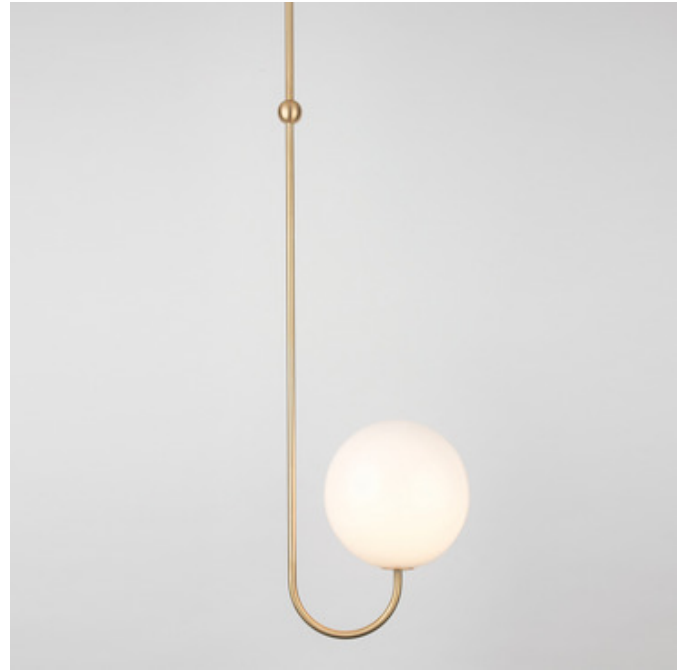
Shown in: Satin Brass / Opal

Inspired by the shape of fishing hooks, Single Angle consists of a luminous sphere and a single hook. The overall height is fixed and cannot be adjusted. Includes a paintable junction box cover which will cover standard 4 inch junction boxes. The j-box cover extends beyond the fixture and will be visible. Upon ordering, please supply required drop length of fixture, measured from the ceiling to bottom fitting. Available from 29 to 85 inches. Height is not field-adjustable. Please contact Customer Service to order.