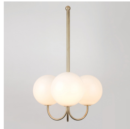
Shown in satin brass / opal

Inspired by the shape of fishing hooks, Triple Angle consists of three luminous spheres and a triple hook. Height is fixed and is not field-adjustable. Includes a paintable junction box cover which will cover standard 4 inch junction boxes. The j-box cover extends beyond the fixture and will be visible.