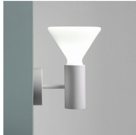
Shown in matte white / white

COLOR RENDERING . . . . . 80 CRI LAMP COLOR . . . . . 3000K LUMENS/WATT . . . . . 76.33 LUMINOUS FLUX . . . . . 916 lumens