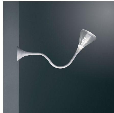
Shown in anthracite grey / transparent

LAMP LIFE . . . . . 50000 hours COLOR RENDERING . . . . . 90 CRI LAMP COLOR . . . . . 2700K LUMENS/WATT . . . . . 65.30 LUMINOUS FLUX . . . . . 1763 lumens