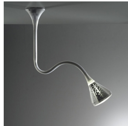
Shown in anthracite grey / transparent

LAMP LIFE . . . . . 50000 hours COLOR RENDERING . . . . . 90 CRI LAMP COLOR . . . . . 2700K LUMENS/WATT . . . . . 69.93 LUMINOUS FLUX . . . . . 1888 lumens