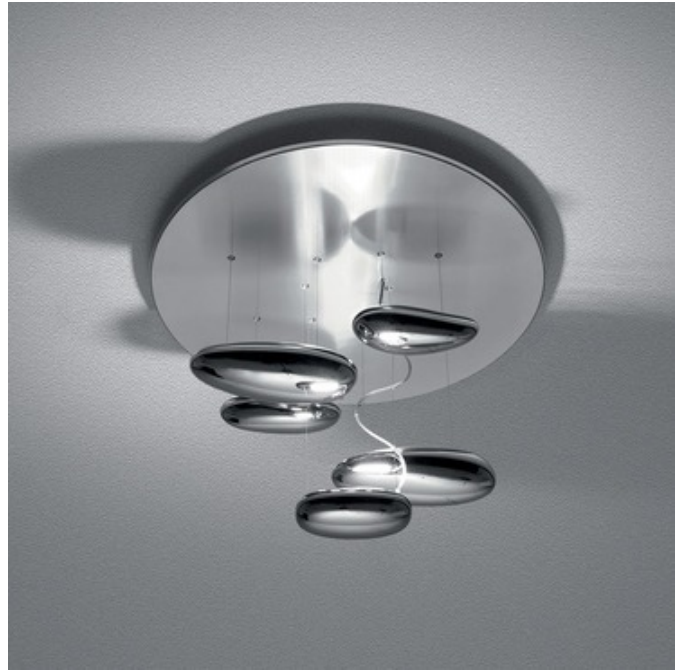
Shown in: Polished Aluminum / Stainless Steel

A floating assembly of pebbles, Ross Lovegrove's Mercury Ceiling Light creates a relationship between reflected light and its environment. Die-cast satin aluminum lighting unit and chrome polished reflective units of injection-molded thermoplastic. Available in two sizes with choice of 2700K or 3000K color temperature.