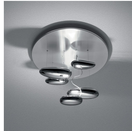
Shown in polished aluminum / stainless steel

LAMP LIFE . . . . . 50000 hours COLOR RENDERING . . . . . 93 CRI LAMP COLOR . . . . . 2700K LUMENS/WATT . . . . . 46.41 LUMINOUS FLUX . . . . . 1346 lumens