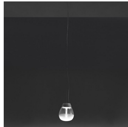
Shown in white / clear

PRODUCT DIMENSIONS . . . . . Canopy: 8.7" diameter LAMP LIFE . . . . . 50000 hours COLOR RENDERING . . . . . 80 CRI LAMP COLOR . . . . . 3000K LUMENS/WATT . . . . . 51.55 LUMINOUS FLUX . . . . . 567 lumens