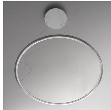
Shown in polished aluminum / transparent

PRODUCT DIMENSIONS . . . . . Canopy: 9.6" diameter LAMP LIFE . . . . . 50000 hours COLOR RENDERING . . . . . 90 CRI LAMP COLOR . . . . . 3000K LUMENS/WATT . . . . . 57.51 LUMINOUS FLUX . . . . . 2835 lumens