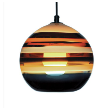
Shown in dark bronze / amber

COLOR Amber BODY FINISH Dark Bronze WATTAGE 4W DIMMER Standard 120V DIMENSIONS 9"W x 8.5"H BULB INCLUDED 1 x G25/Medium (E26)/4W/120V LED OTHER BULB OPTIONS 1 x G25/Medium (E26)/120V LED COUNTRY OF ORIGIN United States