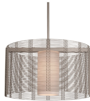
Shown in beige silver / frosted

COLOR RENDERING . . . . . 93 CRI LAMP COLOR . . . . . 2700K LUMENS/WATT . . . . . 65.00 LUMINOUS FLUX . . . . . 1365 lumens