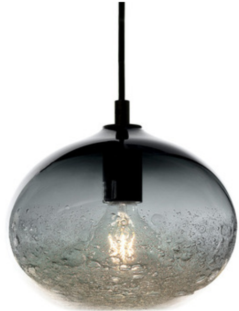
Shown in: Dark Bronze / Grey Bubble

The Bubble Ellipse Pendant brings a unique elegance to your interior space. A swath of textured whipped glass is paired with a selection of soft colors and simple forms, creating warm ambient light across your room. Made in California and signed by Caleb and Carmen. Note: Each piece is hand blown and shaped. No molds are used, and each glass shape is unique. Dimensions, weights, and color will vary slightly.