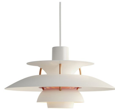
Shown in white / modern white

PRODUCT DIMENSIONS . . . . . Cord Length: 144"