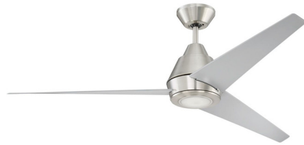
Shown in brushed polished nickel / brushed nickel

Acadian Ceiling Fan with Light proves that your ceiling fan can be simple without being boring. Understated and modern, this tri-blade design will cool your room without over complicating your decor. Features a standard 3-speed reversible 153x17mm motor, 16 degree blade pitch and 56 inch blade span. Dual Mount (flat or angled ceiling up to 23 degrees). One 4 inch and one 6 inch downrod and 4-speed wall control included with reversible motor. Note: Flat Black finish suitable for wet location. Brushed Polished Nickel finish suitable for indoor location only.