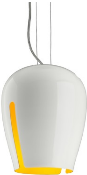
Shown in: White Outer/Melon Inner

The Zita Pendant offers retro style, featuring a precision press-formed aluminium shade with a painted surface and slit details for added luminescence. Available with a White Outer/Melon Inner, White Outer/White Inner, or Black Outer/White Inner in three sizes. Small: One 60 watt max 120 volt medium base bulb is required, but not included. 7.87 inch width x 9.5 inch height x 127.5 inch maximum length. Medium: One 100 watt max 120 volt medium base bulb is required, but not included. 11.75 inch width x 13.75 inch height x 131.75 inch maximum length. Large: One 150 watt max 120 volt medium base bulb is required, but not included. 15.75 inch width x 18.5 inch height x 136.5 inch maximum length. Suitable for dry and damp locations. ETL and UL listed.