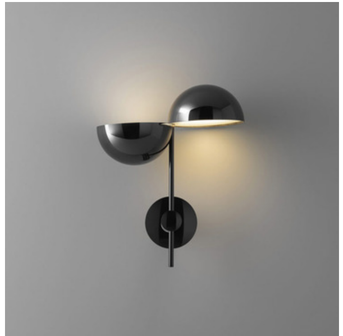
Shown in: Glossy Black Nickel / Glossy Black Nickel

The Elisabeth Wall Sconce brings a clean art deco look to your interior space. The unique sphere like shade is split in half that emits light both up and down.