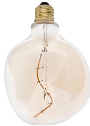
Shown in iron tint

LAMP LIFE . . . . . 15000 hours BEAM ANGLE . . . . . 360° COLOR RENDERING . . . . . 95 CRI LAMP COLOR . . . . . 2200K LUMENS/WATT . . . . . 40.00 LUMINOUS FLUX . . . . . 80 lumens