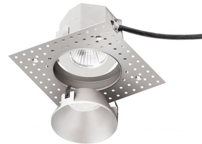
Shown in haze