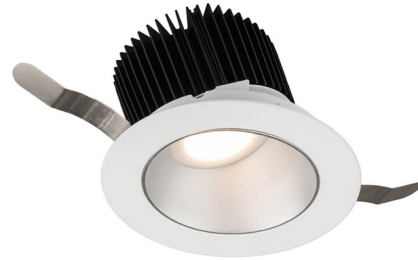
Shown in white / haze reflector