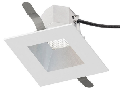
Shown in white / haze reflector