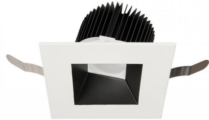
Shown in white / black reflector