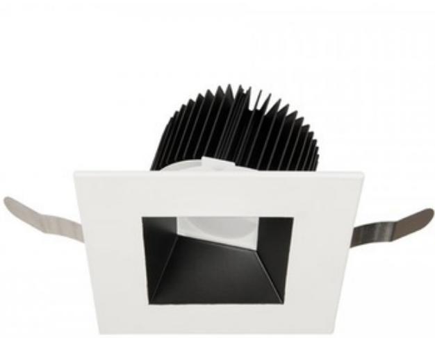
Shown in: White / Black Reflector

Aether 3.5 Inch Square Wall Wash Trim features die-cast aluminum construction available with a powder-coated White trim with a White, Haze, or Black reflector, or all Brushed Nickel finish. Integrated 15.5 watt universal input voltage (120-277V) LED module. Dimmable to 0% with 0-10V dimmers (120 & 277V) or to 10% with low-voltage electronic dimmers (120V only). Choice of 2700K, 3000K with 90CRI or 2700K, 3000K, 3500K, and 4000K color temperature with 85CRI. 35 degree cut-off angle for downlight. 3.5 inch trim aperture and housing height. Accommodates ceiling thickness of 0.5-1.5 inches. 5 year WAC Lighting warranty. ETL listed. Suitable for wet locations. Title 24 compliant. A complete fixture includes a housing and trim, sold separately. Note: 90CRI option is only available in 2700K and 3000K.