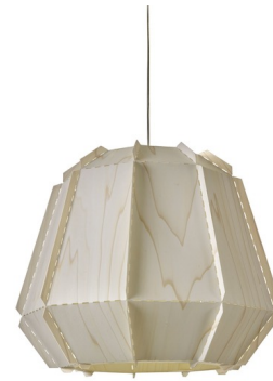
Shown in chrome / ivory white

PRODUCT DIMENSIONS . . . . . Canopy: 4.5" diameter