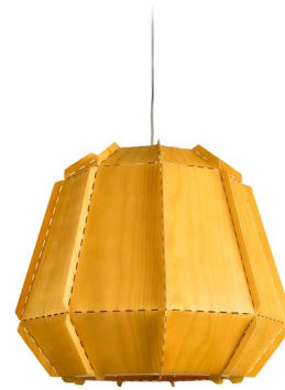
Shown in chrome / yellow

The Stitches Bamako Pendant, designed by Egbert-Jan Lam of Netherlands based Burojet Design Studio, is named after a place in Mali, West Africa, known for its long history as a producer of embroidery. Veneer lengths are crafted in a traditional sewing fashion - by marking out a pattern, cutting it and then repeating, so producing an individual lamp. Light shines through the visible hemstitching, cleverly simulating the embellished stitches found on cloth. It hints at the simple beauty found in Malain embroidery.