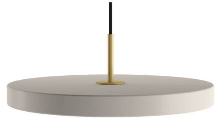
Shown in brass / pearl