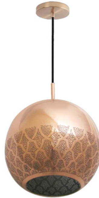
Shown in: Copper

The Nur Reversed Pendant offers a modern silhouette combined with the craftsmanship of Moroccan design, featuring an intricate design on the base of the pendant derived from 12th century Almohad tile work. The small holes in the shade allow for brilliant shadows to be cast when illuminated.